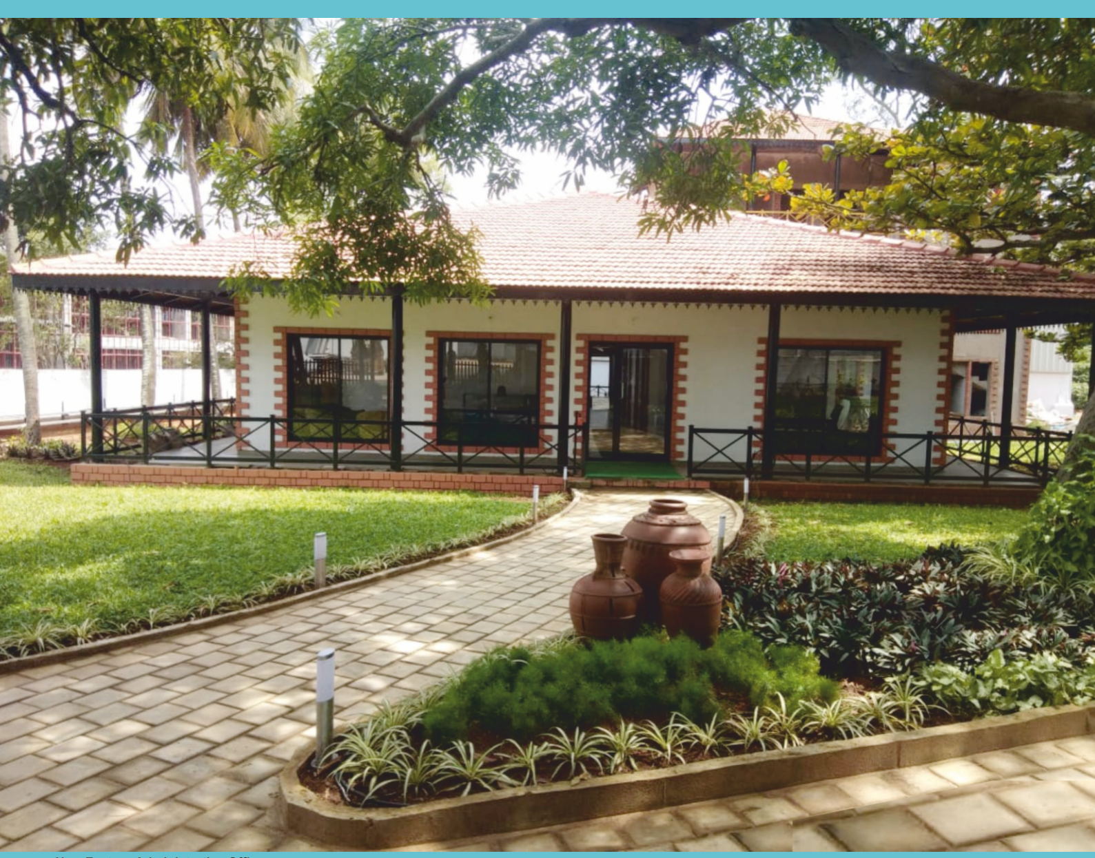
New Factory Administrative Office